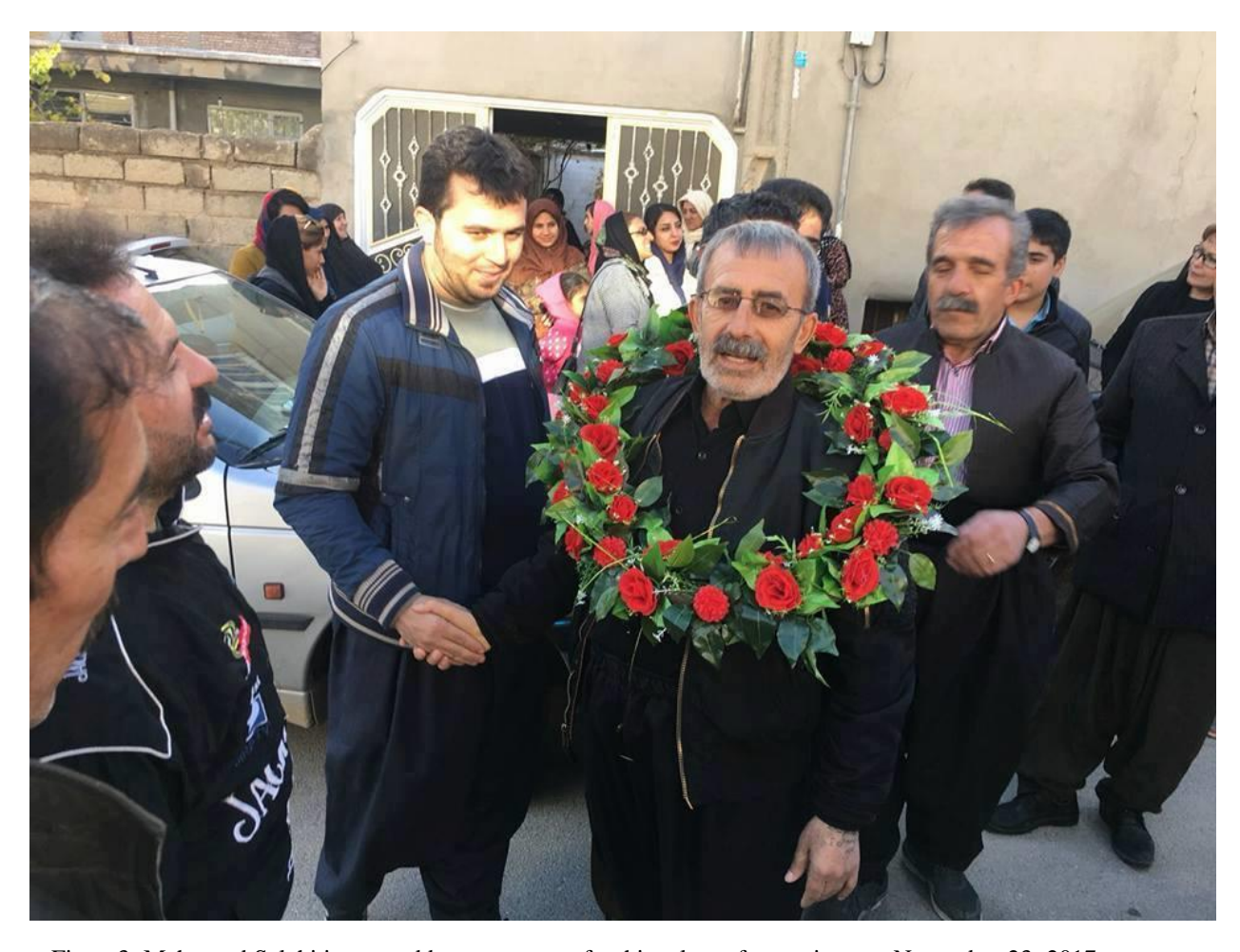
Figure 3: Mahmoud Salehi is greeted by supporters after his release from prison on November 23, 2017.